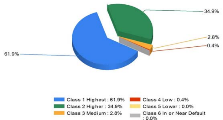
Distribution of bond classes